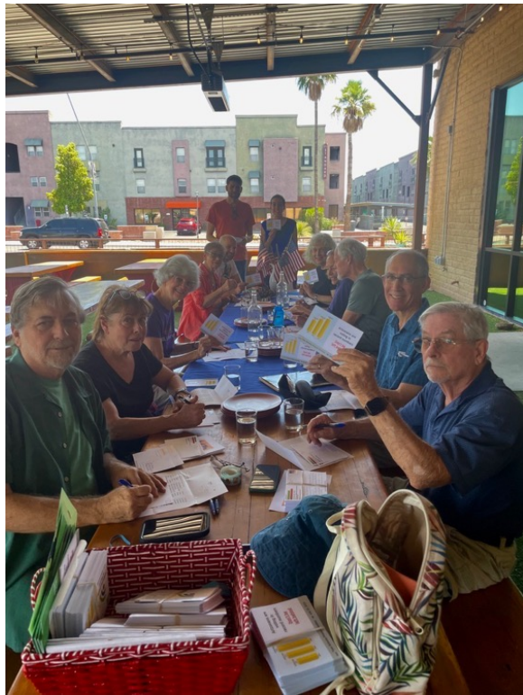
June 15, Brother John's