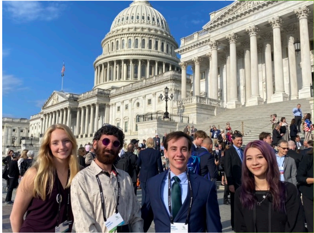
CCL Student scholars prepare to lobby June 11, 2024